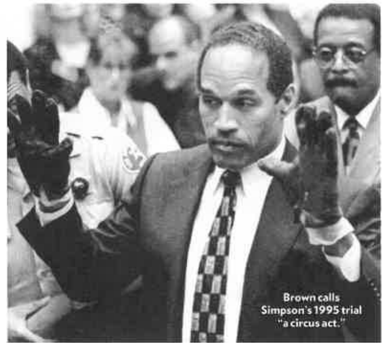
Brown calls Simpson's 1995 trial "a circus act."